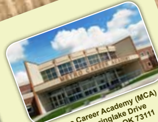
Metro Career Academy (MCA) 1901 Springlake Drive Oklahoma City, OK 73111