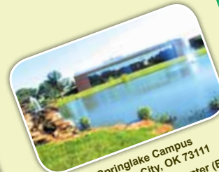
Springlake Campus Oklahoma City, OK 73111 Business Conference Center (BCC) 1900 Springlake Drive