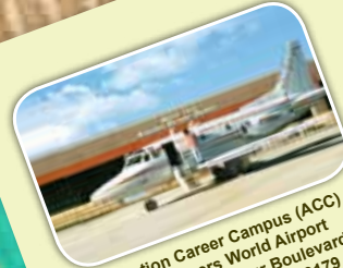
Aviation Career Campus (ACC) Will Rogers World Airport 5600 S. MacArthur Boulevard Oklahoma City, OK 73179