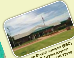
South Bryant Campus (SBC) 4901 S. Bryant Avenue Oklahoma City, OK 73129